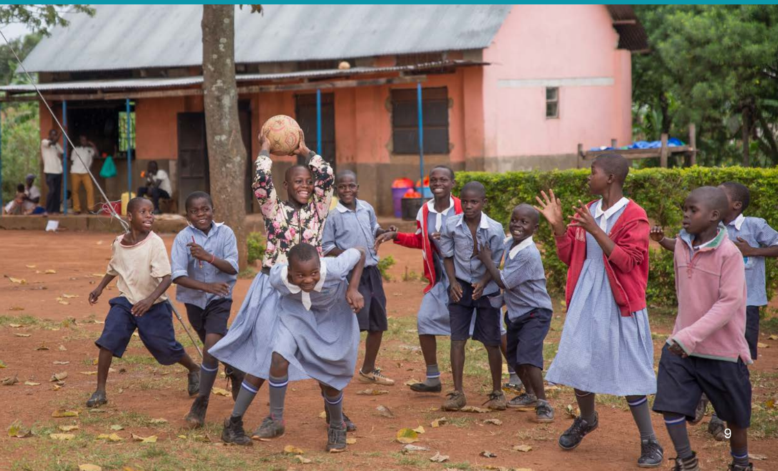
Students playing netball on campus.