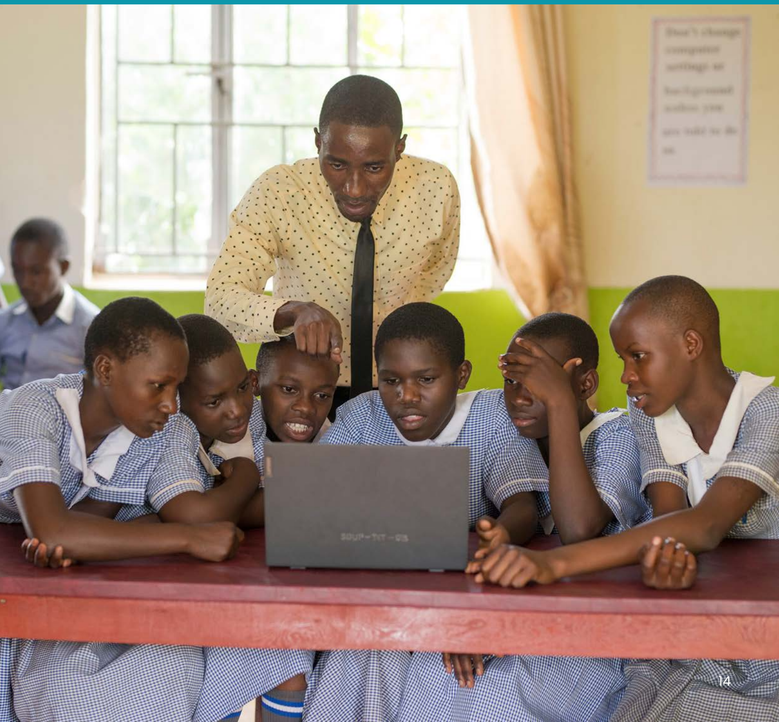
Primary students enjoying a lesson in the new computer lab.

In 2022, The SOUP established a computer lab where students can build computer literacy and participate in self-directed learning. The SOUP also hired its first IT Technician who helps facilitate lessons with teachers and students, ensures the functioning of all equipment, and keeps the IT curriculum updated. In 2023, The SOUP will purchase additional desktop computers and laptops to increase student and teacher access to technology. Six tablets were also purchased to support program data collection.