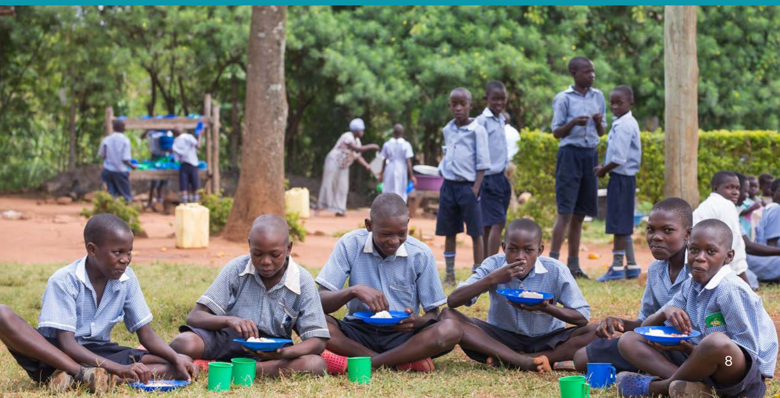
Primary students eating lunch outside on The SOUP campus.

The SOUP School offers students a range of co-curricular activities, including scouting, music, athletics, and drama. Our School also has a library, a computer lab, and a large community garden where we provide lessons in sustainable agriculture. All students, faculty and staff receive two hot, nutritious meals a day, and boarding students receive an evening meal as well.