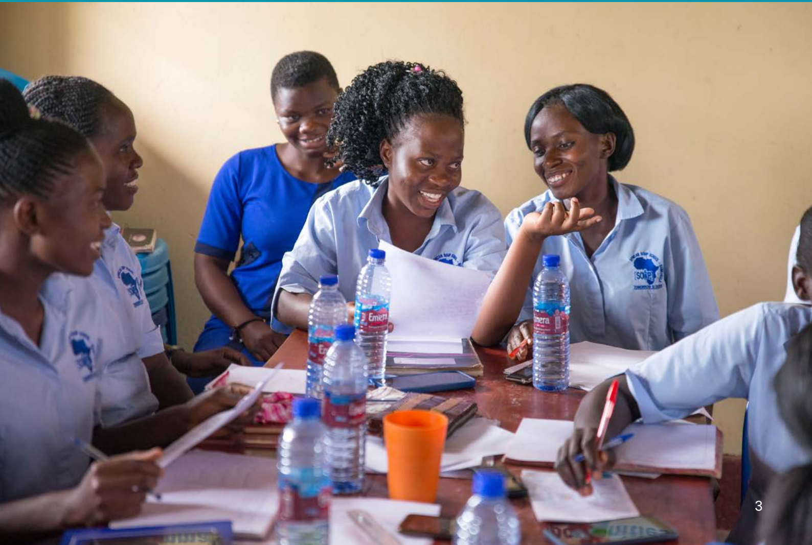
SOUP teachers participate in a lesson on active learning at The SOUP campus.