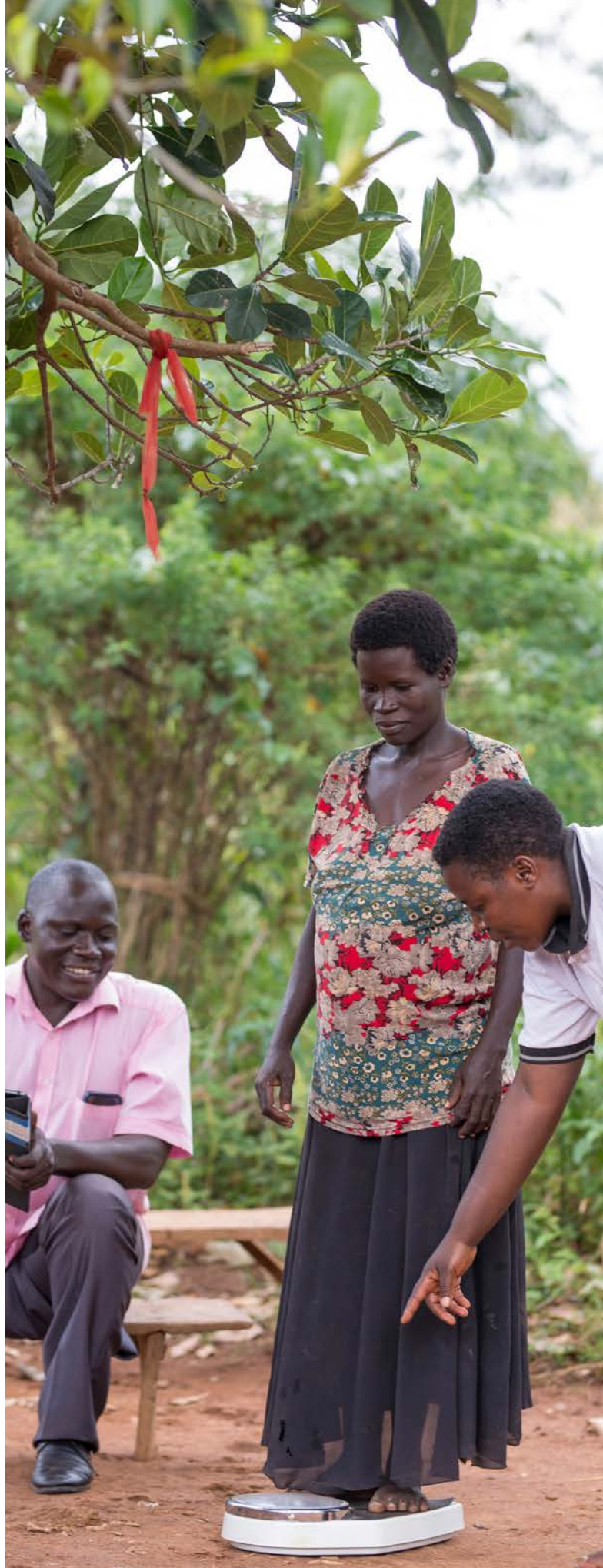
A mother being weighed as part of the EBS program.

EBS helps ensure children are prepared to enter The SOUP Nursery School ready to learn and grow. EBS also fosters small business development and entrepreneurship, which has allowed a number of women to launch their own ventures and enhance their financial stability and the overall well-being of their families.