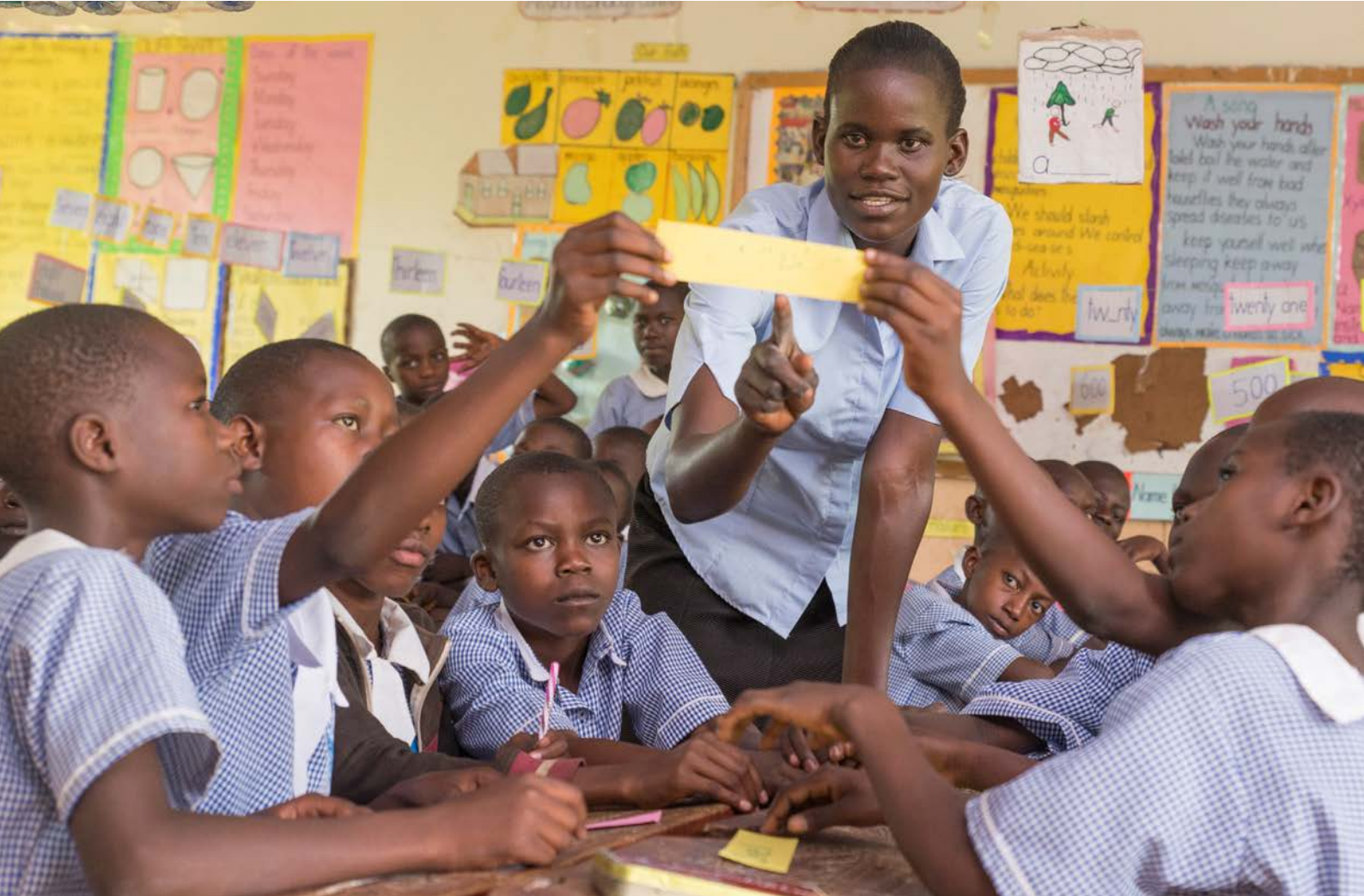
An active learning lesson in a primary classroom at The SOUP School.