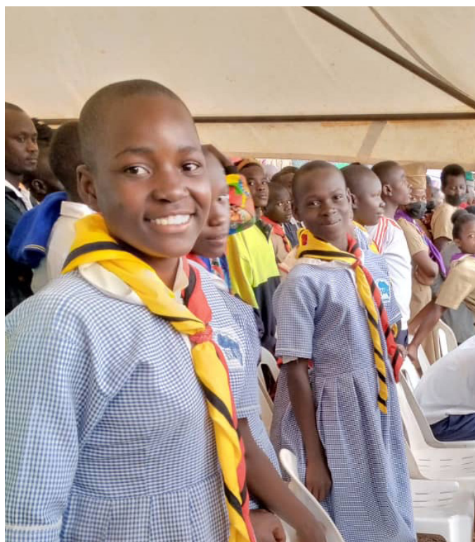
SOUP students at the National Scout Camp.