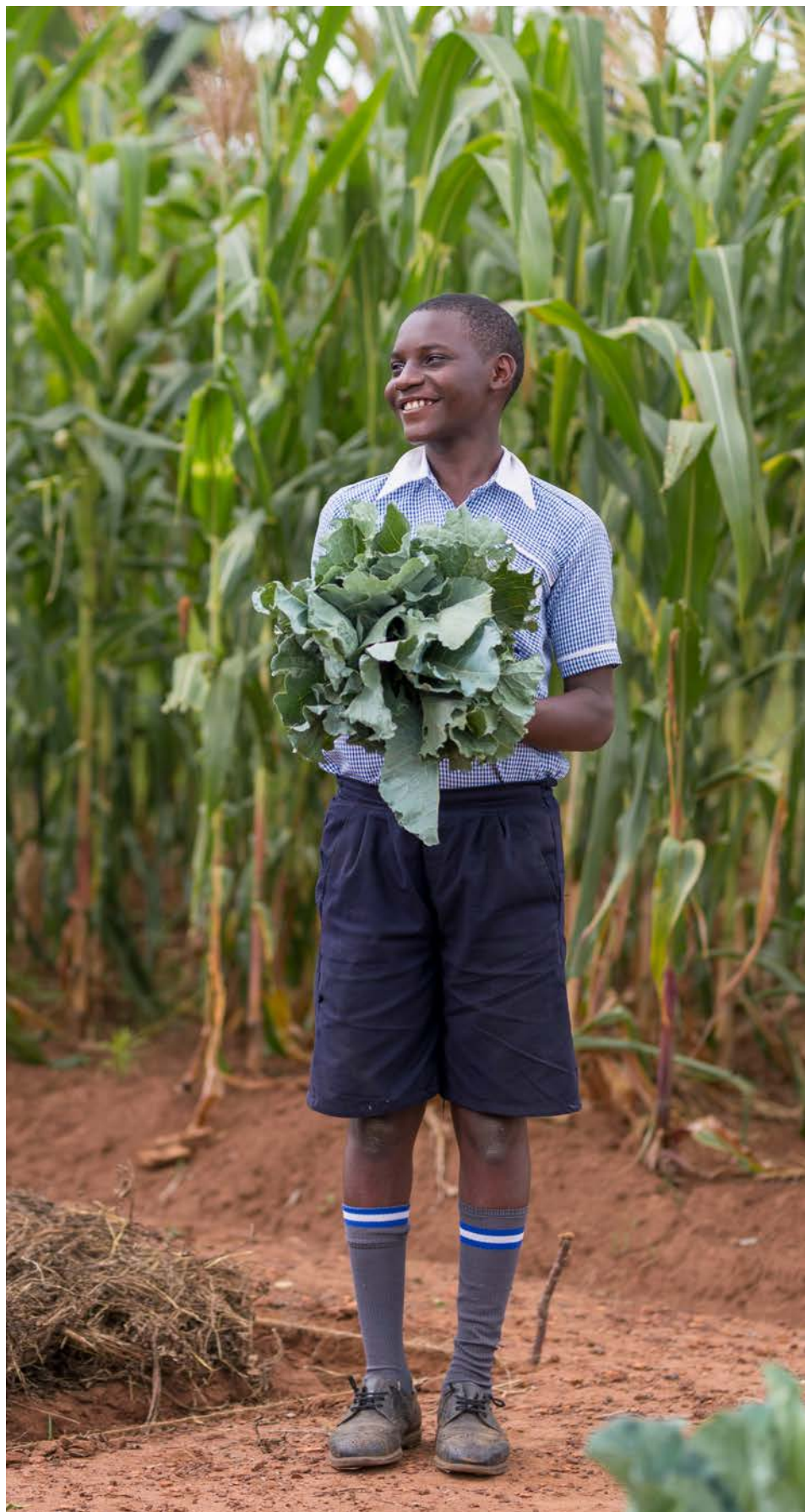
A SOUP student holding produce harvested from our community garden.