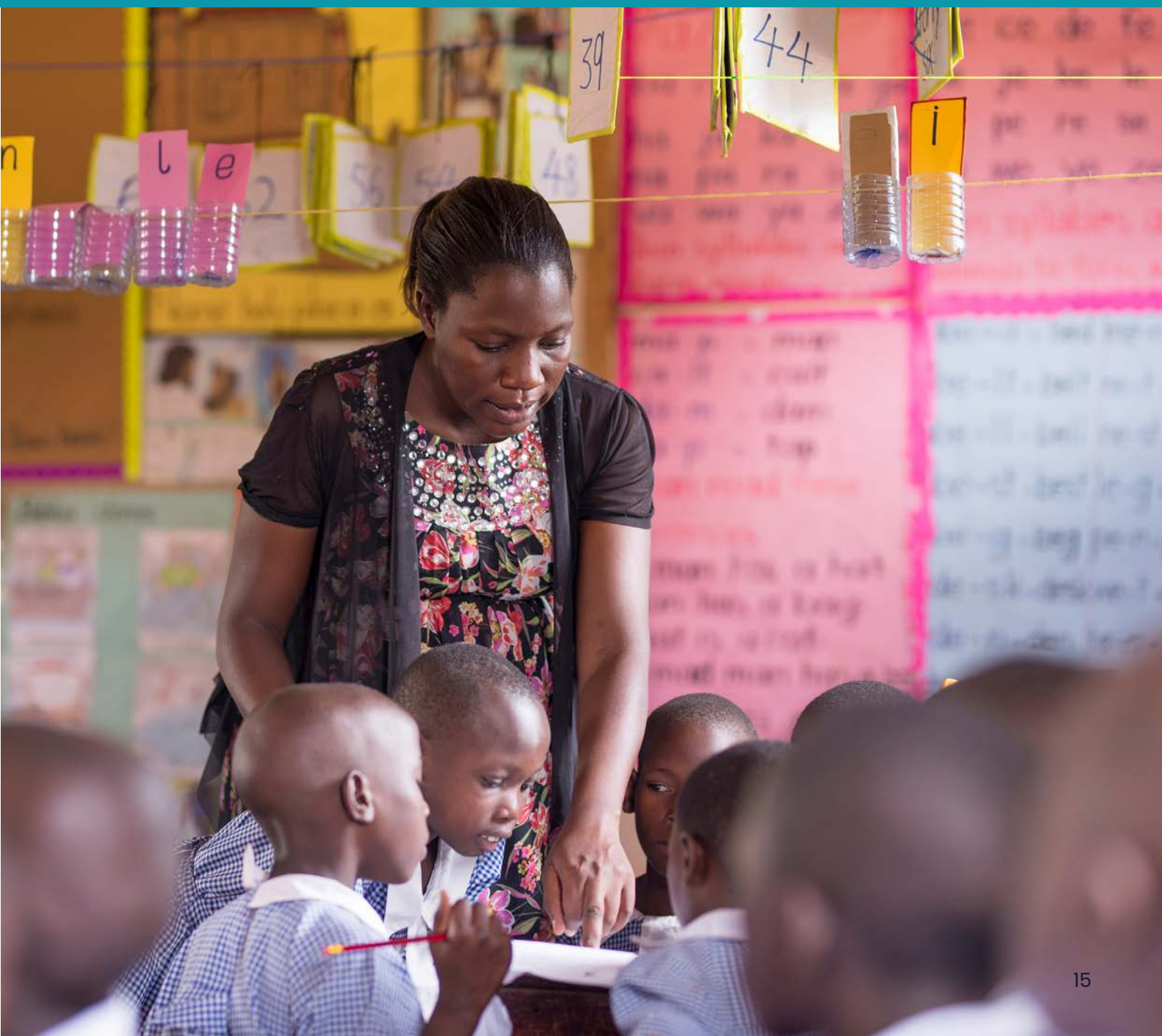
Children engaged in active learning on The SOUP campus.

A generous donor who is passionate about our vision for national education reform through active learning has funded an engagement for The SOUP with the global consulting firm KPMG. The firm brings together an experienced global network of professionals that delivers industry leading practices, research and solutions. KPMG will work with The African SOUP to measure the impact generated by The SOUP's initiatives in Uganda with a focus on the ALP and our School as a demonstration lab for active learning. This relationship represents a tremendous opportunity for growth and learning as an organization and will set the stage for even greater national impact.